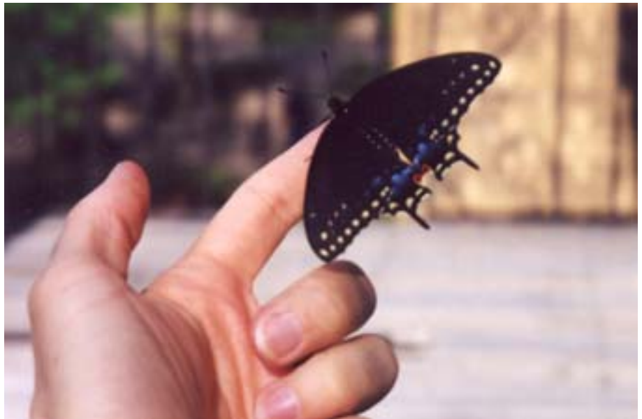
A newborn butterfly

Church of the Sojourners 1127 Florida St San Francisco, CA 94110 <debgish@aol.com> (415) 824-8931 voice & fax