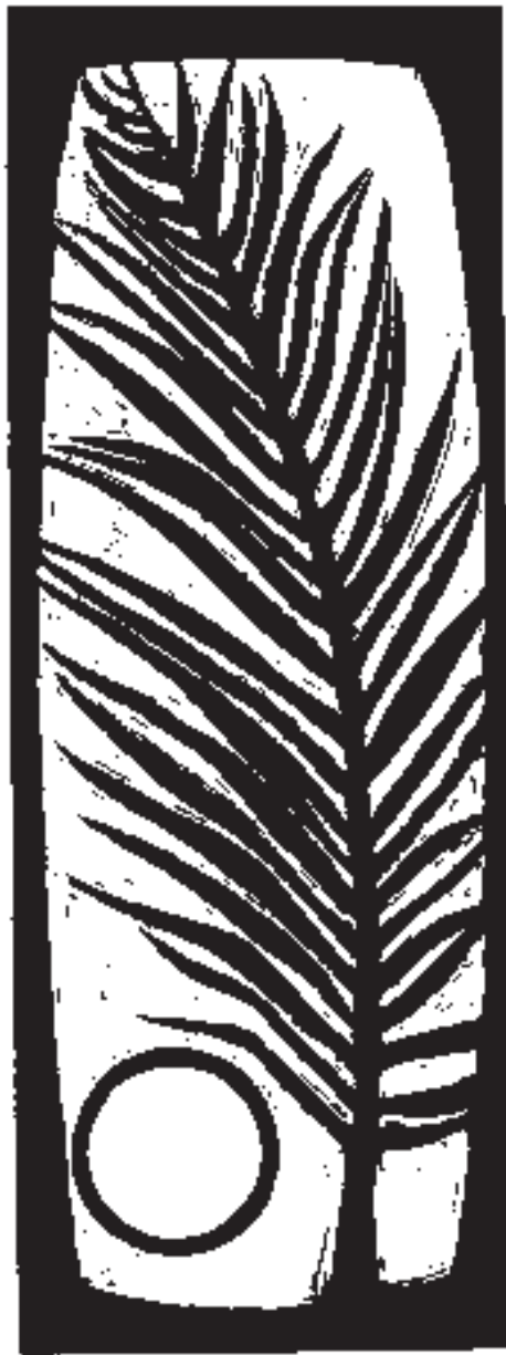
Mennonite Aid Union

There are certainly other situations where MAU members are helped by their churches during a crisis. However, our application, which includes these commitments