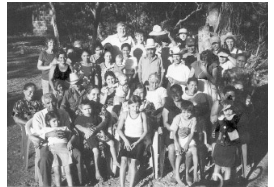
Valle Nuevo Assembly

Every year since 1992 during the week of March 18, some folks from Reba and now from other communities as well head down to our sister community of Valle Nuevo, El Salvador, to continue growing in relationship with them and to accompany them in commemorating the crossing of the Lempa River as they fled into Honduras and became refugees on March 18, 1981, remembering those who died that day and giving thanks for those who survived. Six