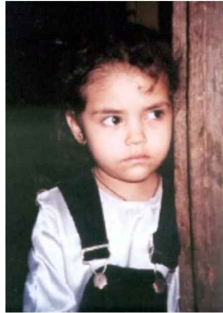
A young girl from Vallue Nuevo.