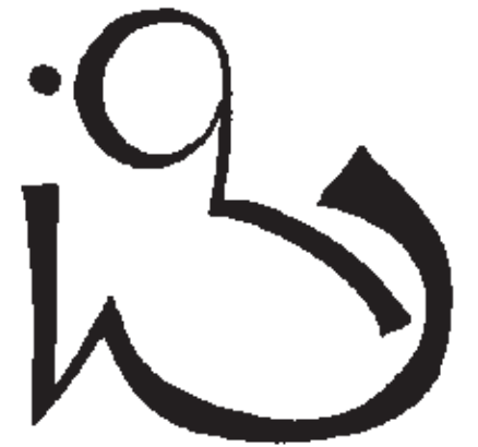
Arabic symbol for peace

Novelists have lamented how hard it is to write a good story about virtue and peace. Why do people gravitate to stories of conflict, violence, sex, and adventure? I think one reason is because such situations challenge us to exercise all the skills and pas-