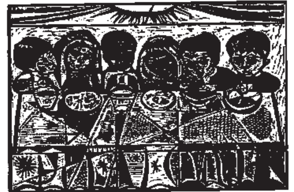
Many Children Dwell in My Father's House