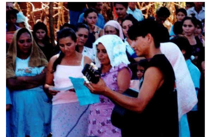
A stop on the Via Crucis , remembering God's deliverance and the martyrs of the Salvadoran civil war.