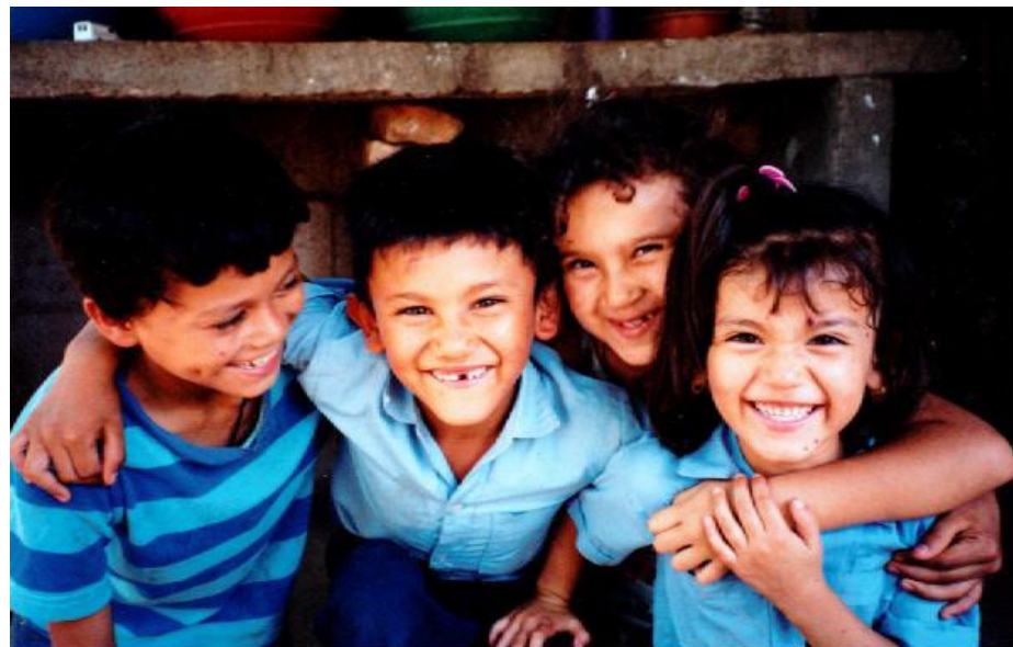
The main reason why we keep coming back to Valle Nuevo—the love of the children and our hopes for their future.