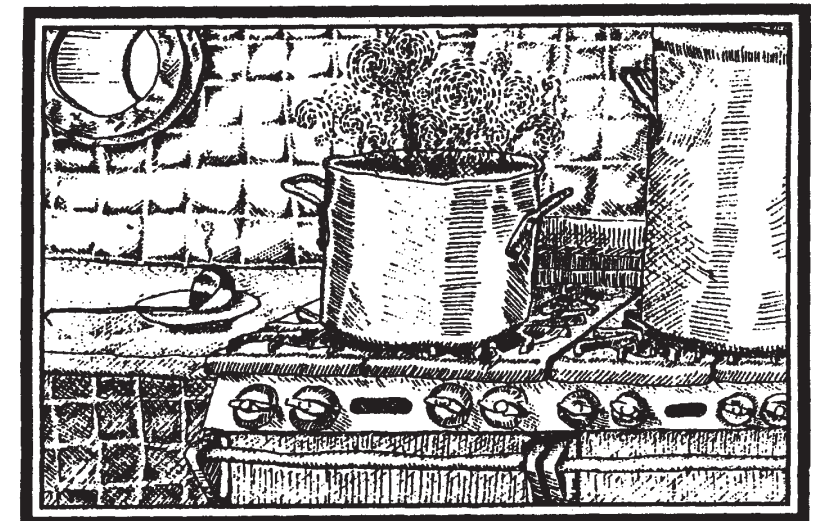
GRAPHIC FROM ST. MARTIN DEPORES CATHOLIC WORKER