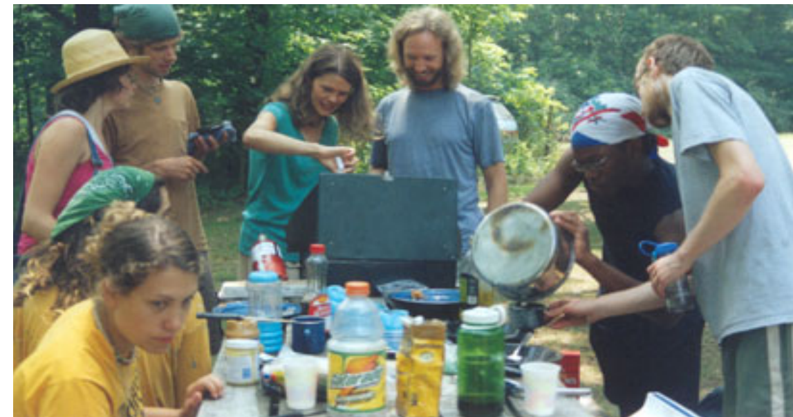
Cooperation among Rebites, former and current, at Mennofolk in Michigan for a meal