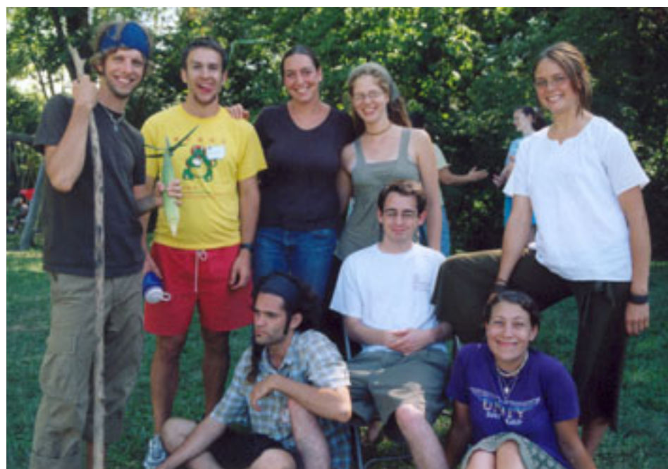
Young people from Camden and Reba UNITE!