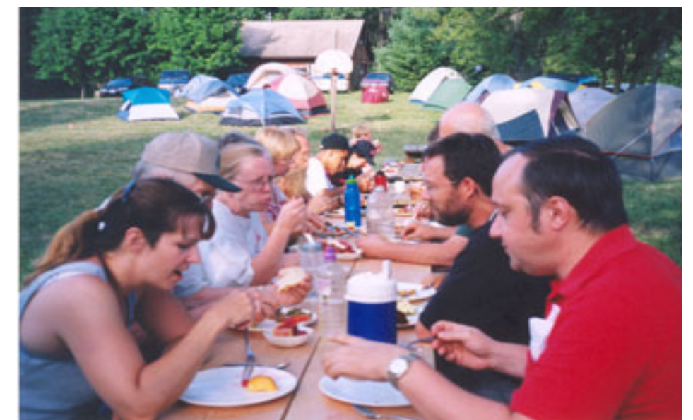
A meal together in view of our tents