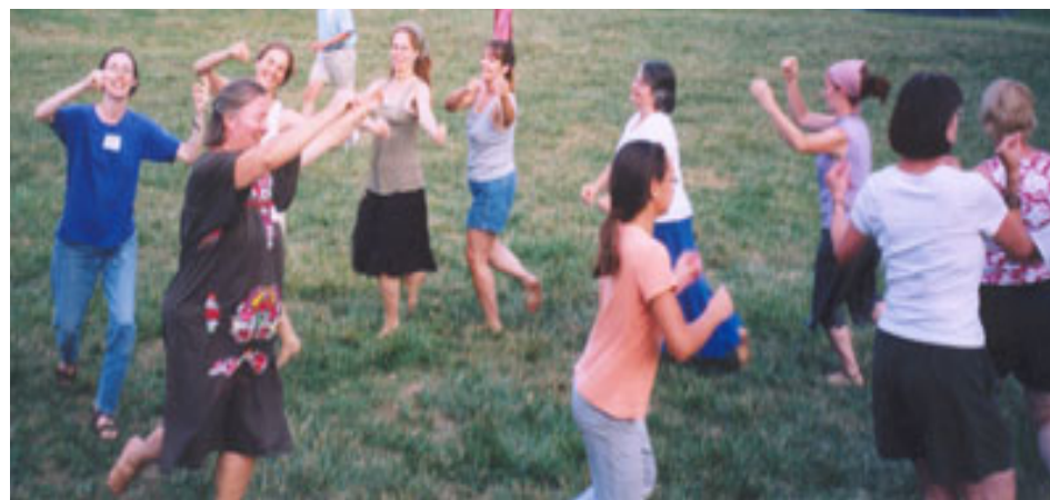
Dance, Dance, Dance to the beat of the Kingdom Revolution

--The American church is worshipping false gods of wealth, messianic imperialism, and individual autonomy, but courageous souls are unmasking these idolatries.