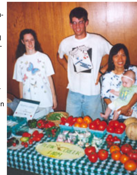
Plow Creek continues to bear good fruit... and vegetables