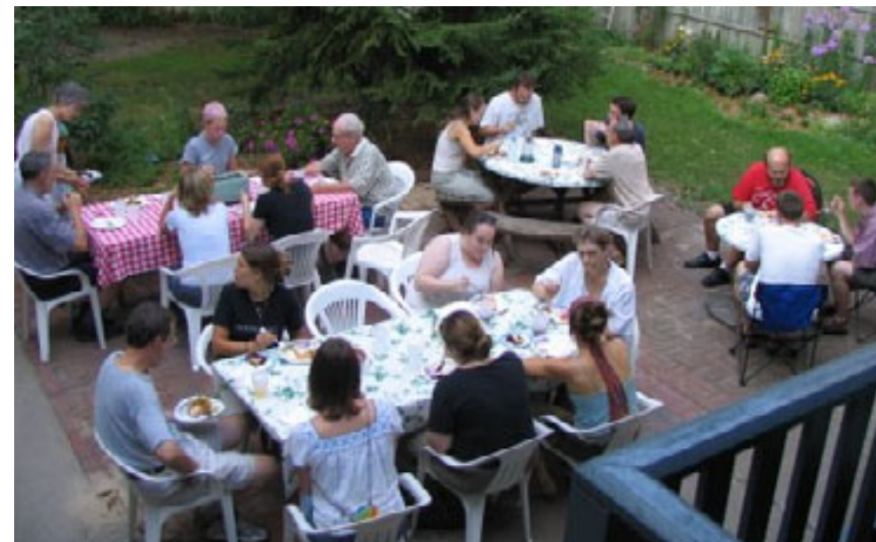
The Cana house backyard during a Monday night potluck