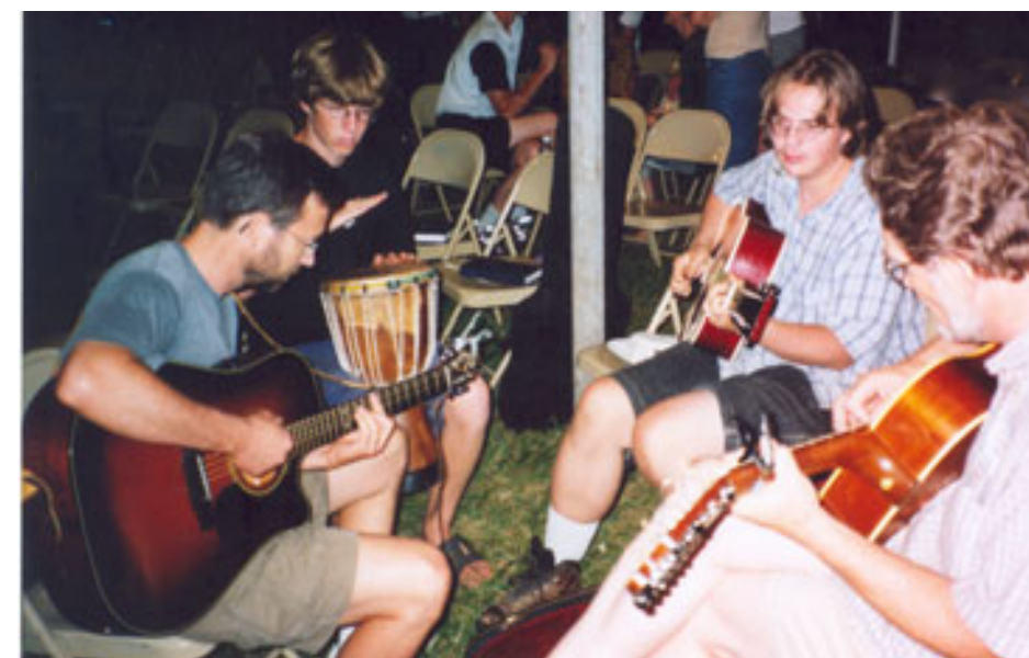
Playing music after bedtime at the Camp Meeting