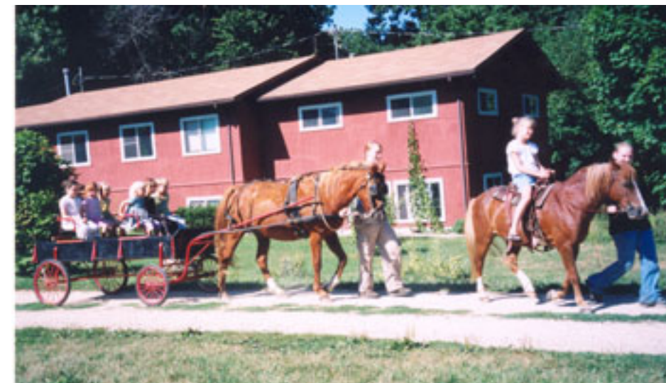
The children had a great time on the horse-drawn cart