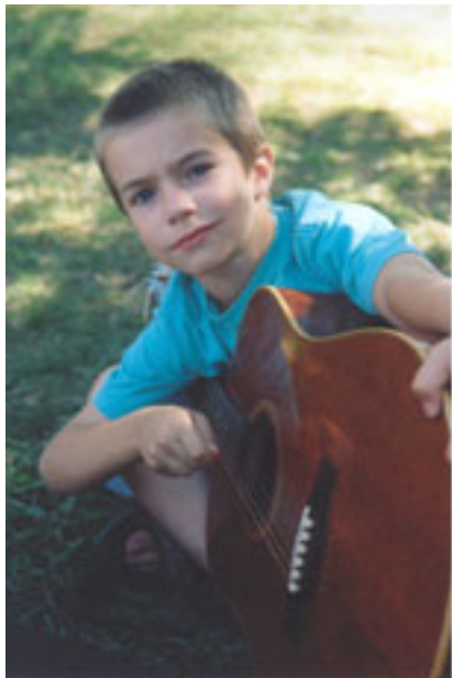
Other way, Ransom.

What is the proper form for the people of God? The great experiment of history, in Lohfink’s eyes, is “the search for the proper form of the people of God. . . . From a theological point of view, it reveals God’s concern for the transformation of human society. This transformation can only occur in freedom. That is why it is such a difficult path through history, in fact a drama that extends throughout the entire history of Is-