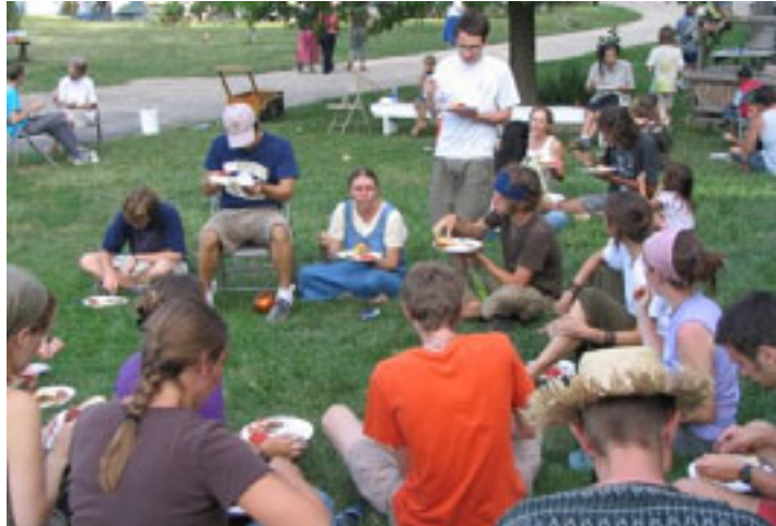
At home with each other- Camp Meeting 2005

ters of modern life, we can gather and praise God for the beauty of coming together in Christian fellowship. You are our home and family now, there for us, and we for you. But we need to stay connected with the youth movement that inspires some to hope for a better world that the present system will never deliver. □