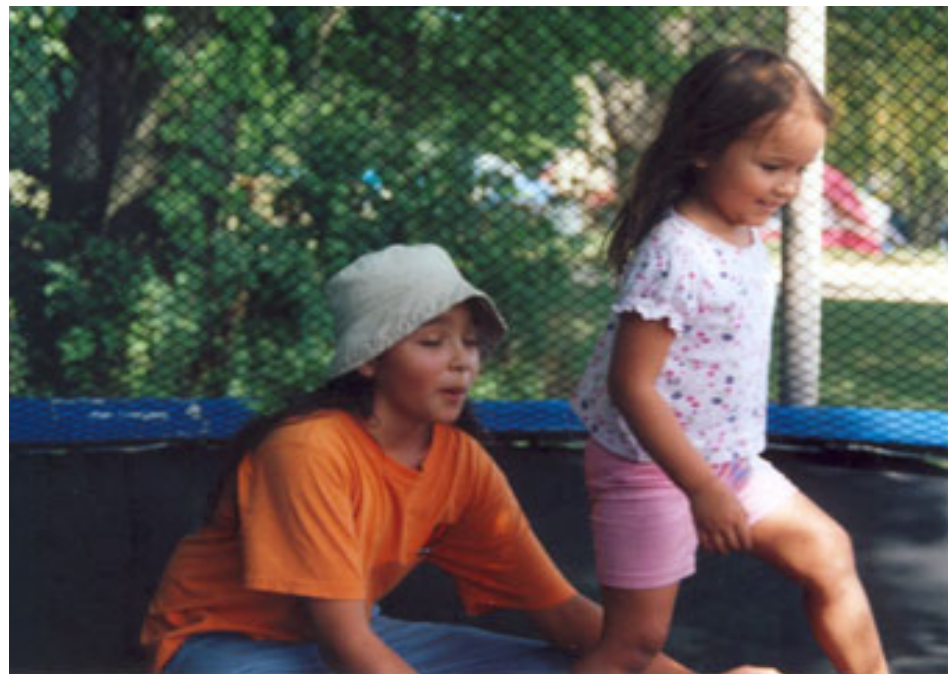
Children on the Plow Creek trampoline