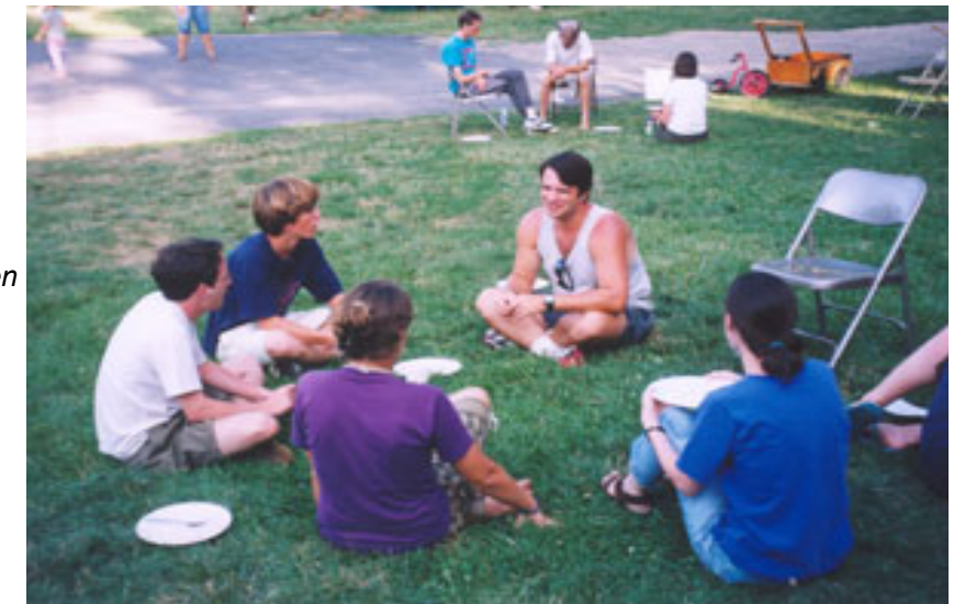
There was plenty of time to get to know each other at the Camp Meeting

Jesus takes: Like the 5,000 who trekked into the wilderness to hear Jesus' words and be healed, we gathered for the Shalom Connections Camp Meeting in the Plow Creek meadow and set up a village of tents around the central pavilion. From Winnipeg, San Francisco, Camden, Philadelphia, Evanston, Chicago, Waco, Comer, Elkhart, Tiskilwa, rural Wisconsin and Saskatchewan--we came as eight communities and assorted seekers, offering our meager "five loaves and two fishes." Under the Camp Meeting tent we offered our communities and our needs to Jesus, present in the home-made bread and grape juice from Plow Creek's vines. In longing for His kingdom we offered the stuff of our lives to Jesus, to take and make of them what he will.