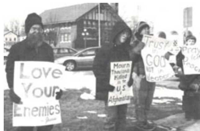
Plow Creekers demonstrating for PAZ!