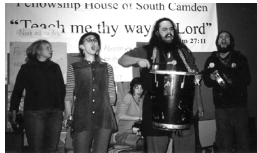
With all their being The Psalters sing at the Family Reunion

It was such a joy to gather together and celebrate the various work God is doing around and through us. May our hearts continue to carry the strength and courage we received from this convergence. □