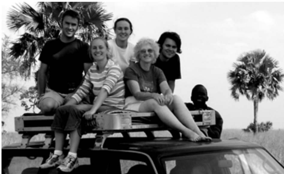
More of the Sojos in Uganda