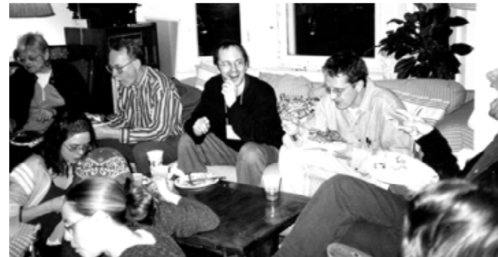
Laughing with one another at the Cana House during a Reba Monday Night Potluck

Grain of Wheat (Exploring SMC membership) 266 Home St. Winnipeg MB Canada R36 1X3 (204) 788-4842 voice