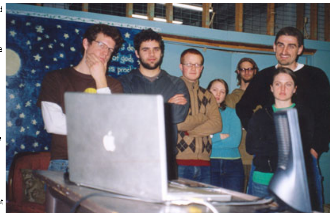
The Family Reunion: sneak preview of “Another World is Possible” Part 3

If the Bible is the handbook of The Revolution , then Irresistible Revolution is a good tract. Pick one up, and when you’re done, pass it on. □