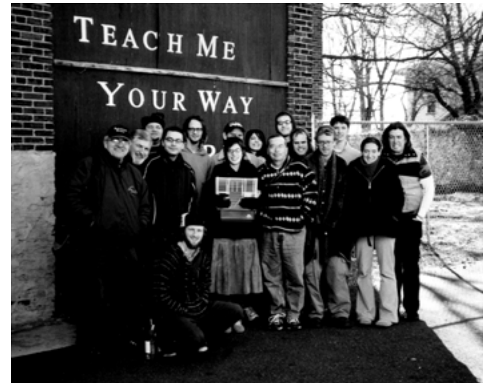
The family reunion outside in Camden, New Jersey