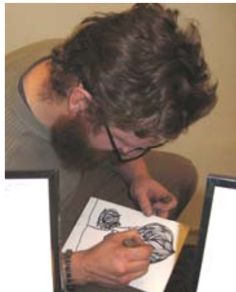
Clockwise, from Above Left.