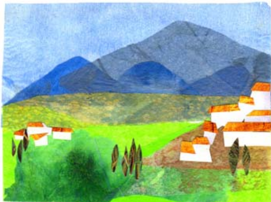
Collage by Hilda Carper

The Fellowship has provided me fine space for a studio. I also do some watercolor, but my favorite medium is collage, using a variety of thin, acid-free paper which I paint with watercolor. Cutting or tearing shapes out of those sheets and layering them gives the effect of watercolor, but the creative process is much freer and more serendipitous. I also use non-translucent papers from nature calendars, National Geographics, etc. I find that as I "play" with the papers, they tell me what to do with them...Oh, here are