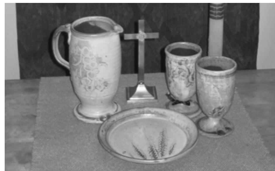
Reba Place Church communion service

I have learned from and appreciated those Mennonite artists in my me-