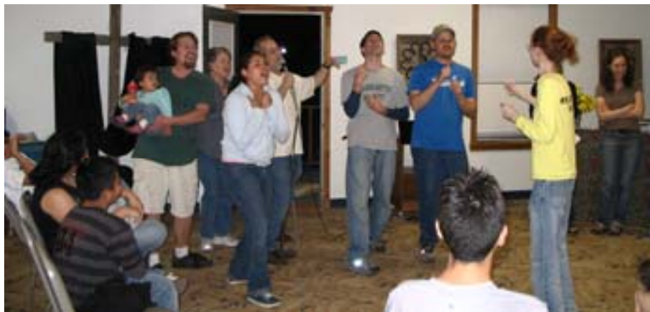
Lack of Talent#1: Small groups sing-off!

Our Lenten season culminated in our traditional Easter retreat to a nearby camp. This year, the retreat was remarkably well attended. More than forty members participated. The weekend began with a Good Friday service and ended with a celebration of the Resurrection on Easter Sunday morning at a "sunrise" service that began at 8:30am. A few extra hours of sleep were necessary after a busy Saturday of community recreation. There was an entire day's worth of opportunities for conversation and deepening of relationships. Some favoured casual groups sitting on various front porches of the retreat center while others pursued organized games of soccer and capture-the-flag. After dinner, a "Lack of Talent Show" brought everyone together with an evening of entertainment. Some talented individuals offered songs and the like, but everyone