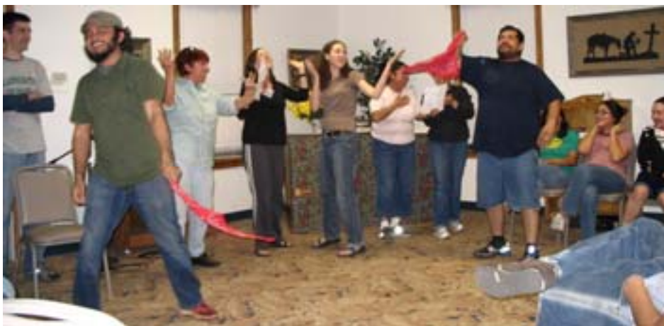
Lack of Talent #2: Interpretive dance!