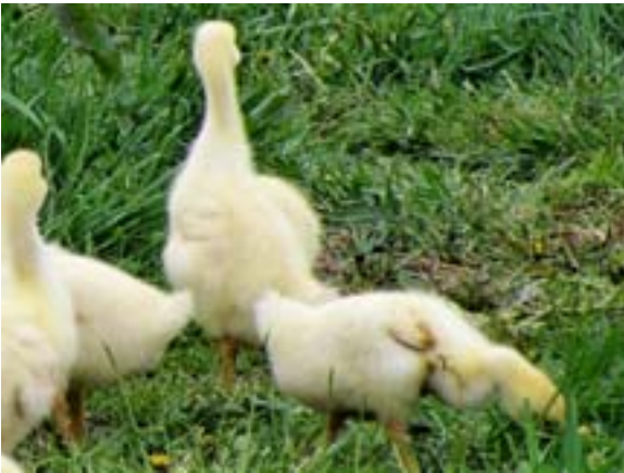
The newest members of the farm team—strawberry-weeding geese!