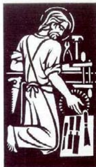
CHRIST THE WORKMAN

Work: The blessing, the curse and the new creation. In the second story of creation (Genesis 2-3) God gives Adam two tasks--tending the Garden that provides him food, and naming all the living species on earth. This latter is a serious research project still ongoing, because naming something, in the Hebrew understanding, both reveals and carries the meaning of what that something actually is. Work is