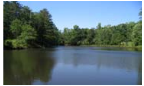
The Jubilee pond—location of many a turtle hunt!

For the Karen, part of the value of food and possessions comes from the struggle and the creativity that provides it. The staff at Jubilee marvel at the abundance of food that the Karen find at Jubilee. As Chou commented to me, "Everywhere they put their eyes, they see food." The tips of green briars in the woods, green onions growing in a ditch, squirrels, voles, all insects, snapping turtles from the