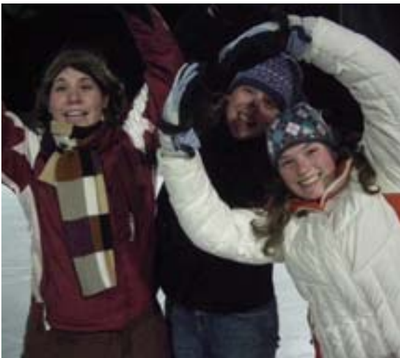
Paying Job #2—being a skating ballerina with Reba Place Church youth group girls.

Over the summer of 2007, we (the collective leadership) at The Recyclery realized that we were earning enough money to start paying people (ourselves) for part-time staff and mechanical work. That freed up some of my time, and not long after, I was asked to become a youth leader at Reba Place Church. If I had these jobs, it meant I wouldn't have to work at Starbucks anymore.