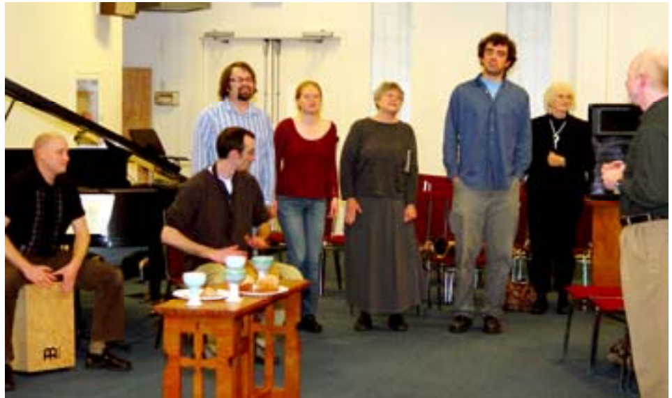
Closing the Celibacy Ceremony with the Psalters version of "Our Father"

Marriage is intended to be a parallel sign, equally not intended to be an end unto itself. In Ephesians 5 we read, "For this reason a man will leave his father and mother and be united to his wife, and the two will become one flesh." And the part often left out of wedding sermons is "This is a profound mystery—but I am talking about Christ and the church." Jesus' first love is his bride the church. We have so bought our culture's idolatry of romantic love that we have forgotten marriage's highest calling to be a sign, to be a sign of the love of Christ for her bride and a foreshadowing of the wedding feast to come. Maybe here in San Francisco some may raise the question "why marry at all?" but overall, few question and most delight in vows exchanged as lovers stare adoringly into each