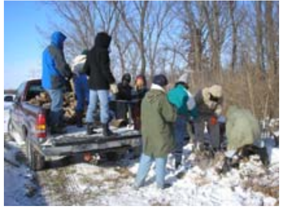
SMC Coordinators hard at work preparing the schedule for next year?

Ah, the brashness and humility of commitments. □