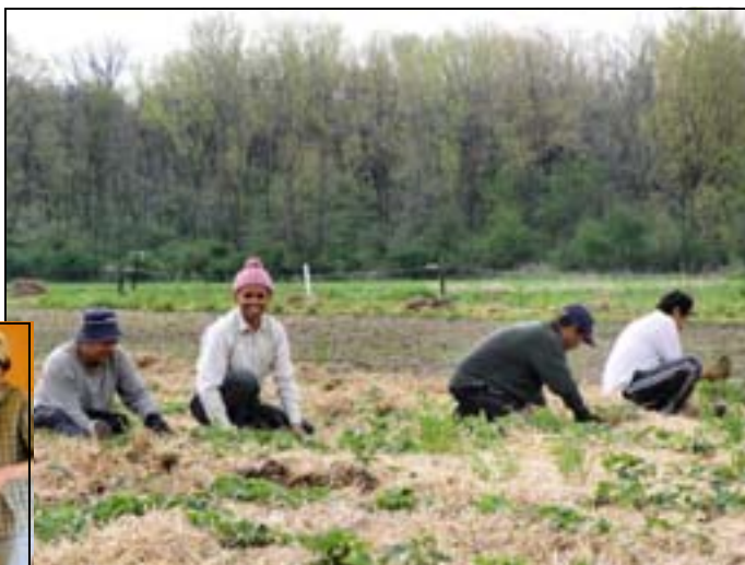
Above: Four Bhutan refugees came from Living Water in Chicago to help weed strawberries and plant tomatoes and melons for four days.