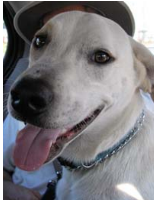
Quijote enjoying some time with his master.

Our efforts remind me of our new dog, Quijote. A little over a year ago we walked the aisles at the animal shelter trying to choose a new family pet. Some of the mutts stood right at the front of the cage, wagging their tails, begging to be liberated. One hung