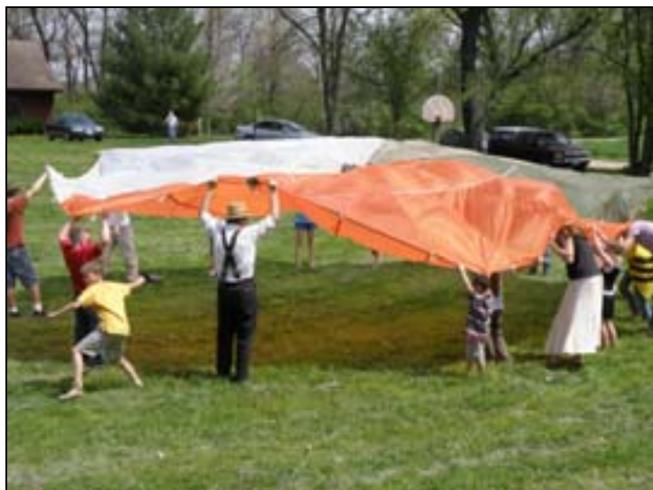
Plow Creek annual May Day party on May 3rd. Festivities included soccer, parachute, games, treasure hunt, colored egg hunts, and delicious goodies.