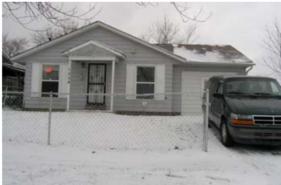
A winter workday at Chico and Tatiana's Ford Heights home.

[Some names of Ford Heights residents have been changed to protect their privacy.]