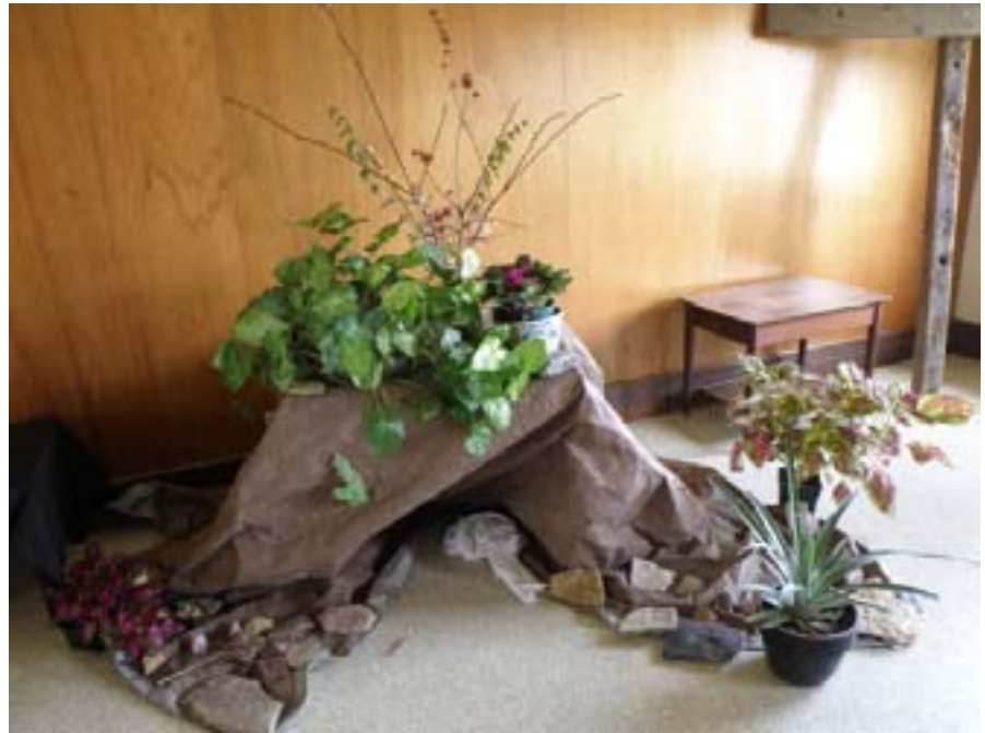
Empty tomb at Plow Creek’s Resurrection Day celebration.

Actually, Quijote doesn’t think these things through; he’s just not that bright. If he could understand English, I would tell him, “You know, it’s not that hard to