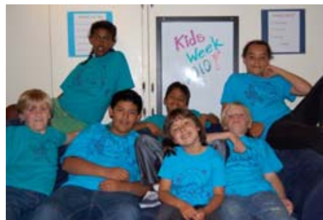
Sojo kids enjoying Kids Week 2010.

peace, Kid's week this year was also focused on peace-making. Kids Week and SMC Youth Week actually occurred at the same time this year. It was interesting that these two things coincided, as it allowed for the groups to intermingle some.