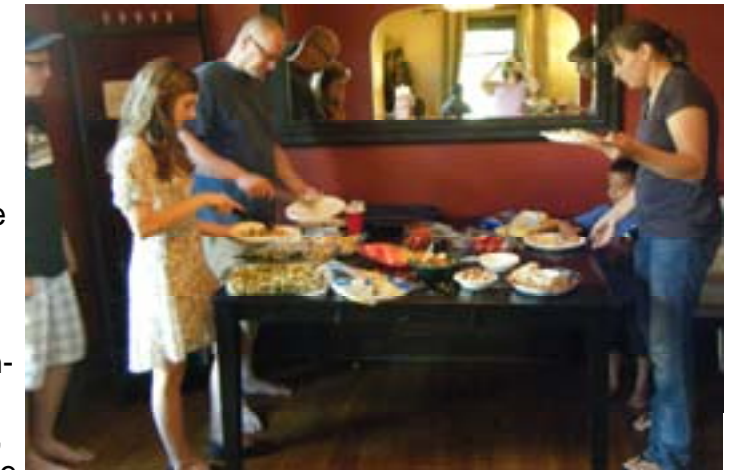
Third Way potluck.