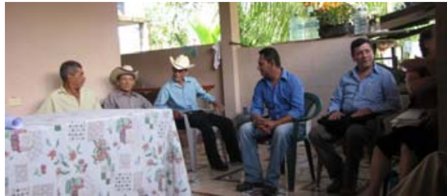
Valle Nuevo meeting over the land legalization process.

That was only the first step. A great deal of work was required to convert the building for our purposes. The providence of God was awesome in that we were able to mobilize and support a team of 6 or 8 workers who labored on this project for more than a