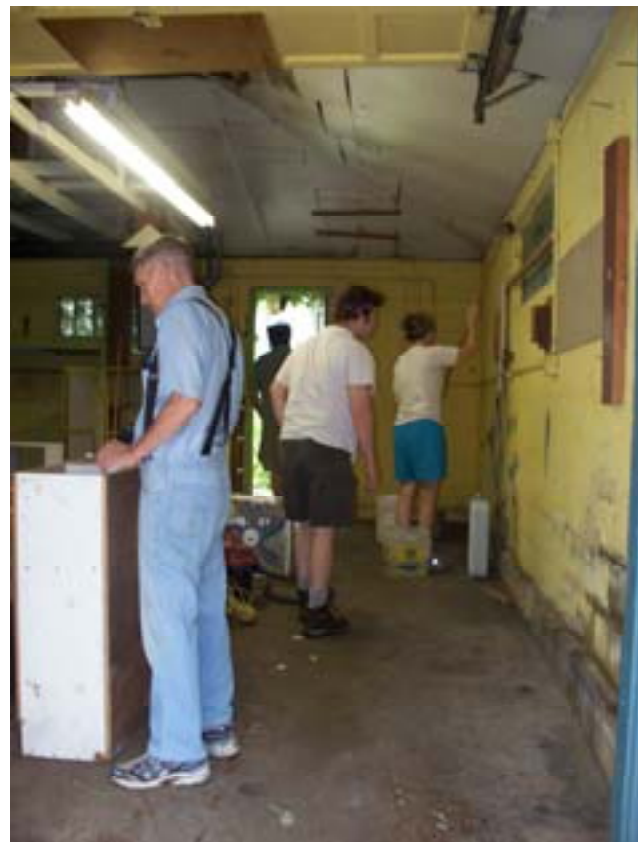
Common work day at Reba.

Trusting God and sharing with one another is a plan that works.