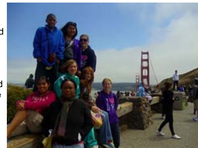
SMC youth hanging out at Golden Gate Park.