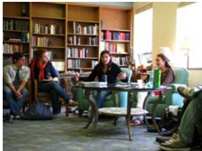
Third Way's Mission and Service Committee.

such a way that we must depend on our Father to sustain us.