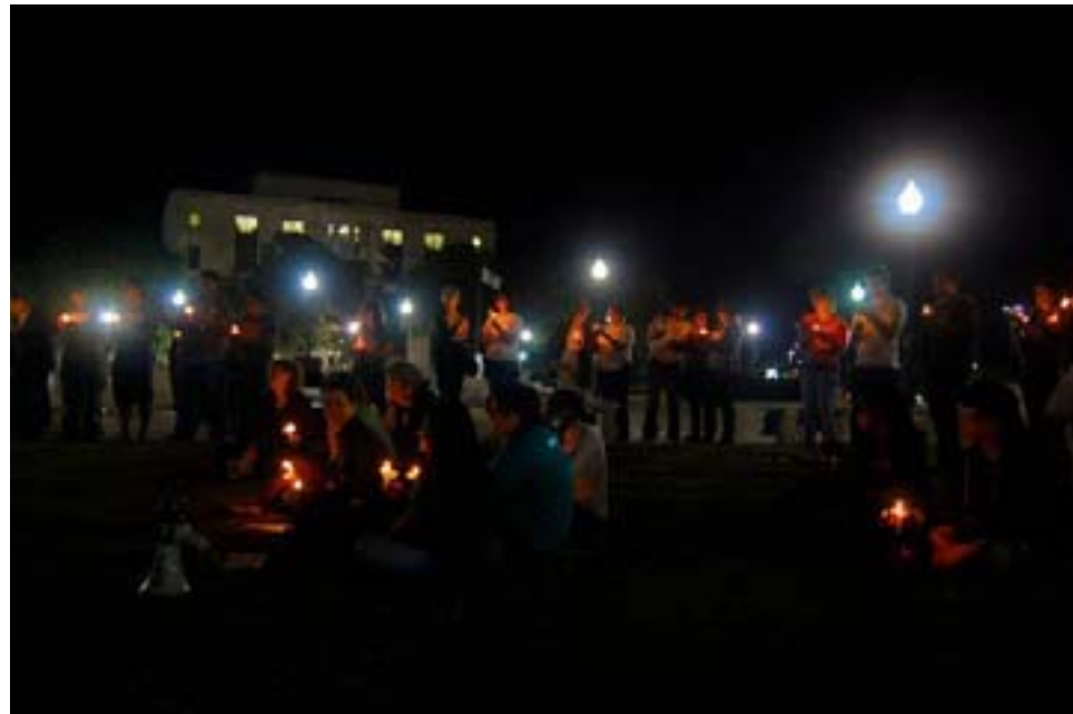
Hope Fellowship joins local DREAM Act supporters for a candle light vigil.

To Mary, Elizabeth's gift is a reminder that God's economy is unconventional. If God had only given this gift maybe five or ten years earlier, Zacharias may have believed it. But God