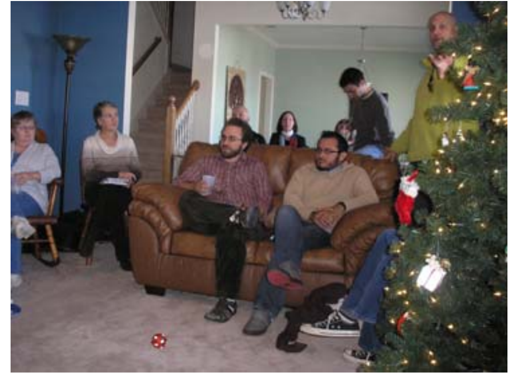
Lasagna Luncheon to discuss growth at Hope Fellowship.