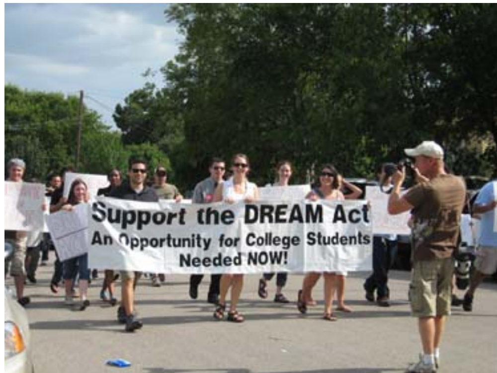
Hope Fellowship joins Waco DREAM Act Alliance for the Mexican Independence Day Parade.