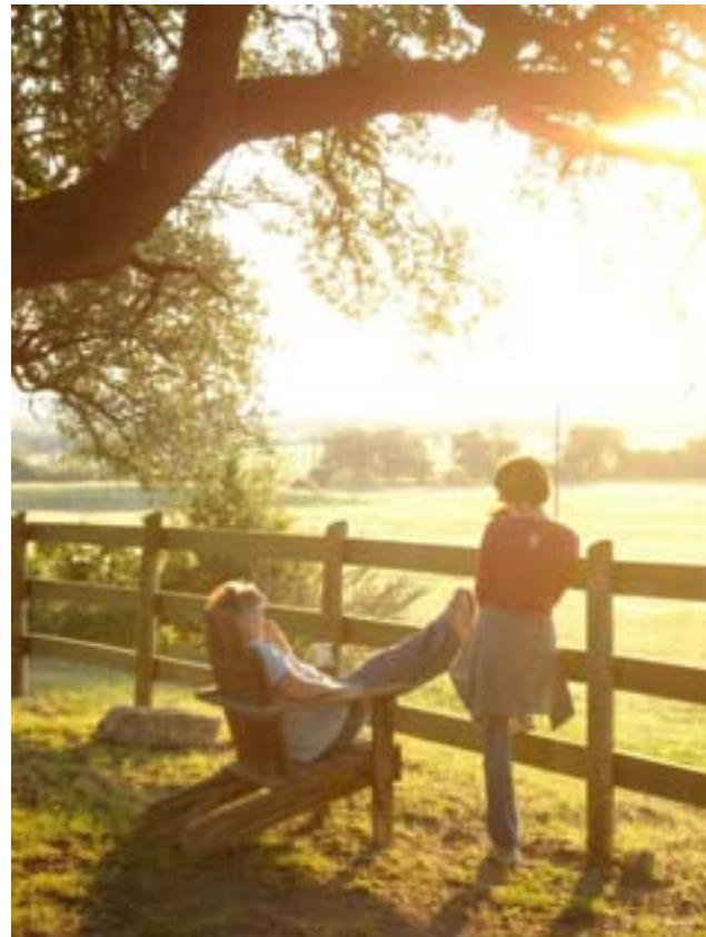
Hope Fellowship women enjoying a break in the countryside.

Furthermore, not only do we know that gifts are not part of an equal economy of