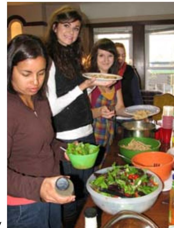
Third Way sharing food at the Fall Retreat.

exchange of equal value between Christ and humans, and Luke enjoys describing the surprise felt by the sinners, women, and tax collectors Jesus gives to along the way. Equally startling is the impossibility of the Kingdom. Could we ever hope to deserve this gift? Do we dare receive this gift? For when we do receive this gift, our world can be and must be remade. This is the Advent of our Lord and the hope it brings. May the gifts we bring to each other create new possibilities for grace, and may the gifts we receive open us up to new understandings of God's Kingdom. □