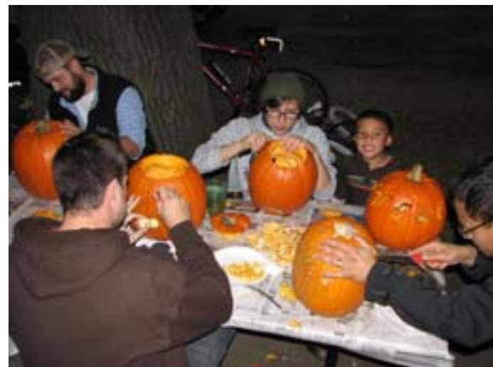
Pumpkin carving at Oktoberfest.

We spent time in corporate worship both Friday and Saturday evenings. We spent most of Saturday morning meeting in smaller groups, each a committee with goals and purpose and tasks to accomplish. Saturday afternoon we played a lively game of Big Base (which is a lot like kickball!), and some folks sat at the park knitting and chatting. Each meal was hosted in a different home, and we ate together the entire