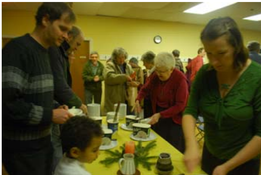
Ice cream crowd at Reba.