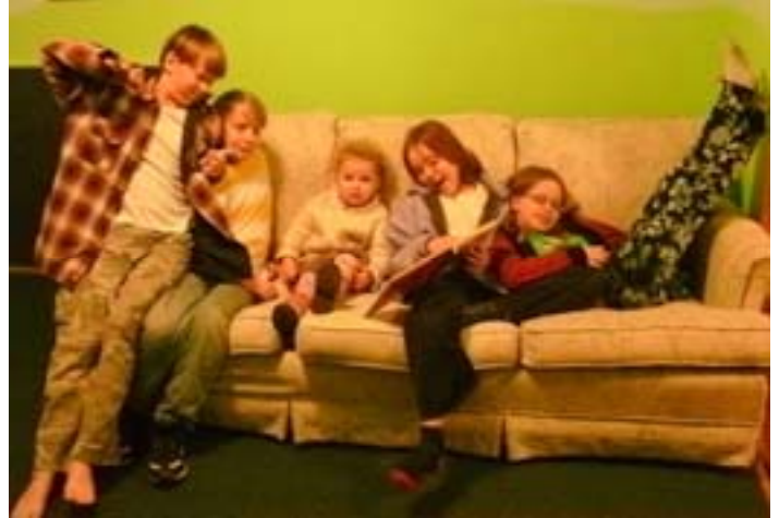
Plow Creek kids goofing around.

We can't gather you into the family because you have been encircled in the arms of God since your first "yes" to Jesus