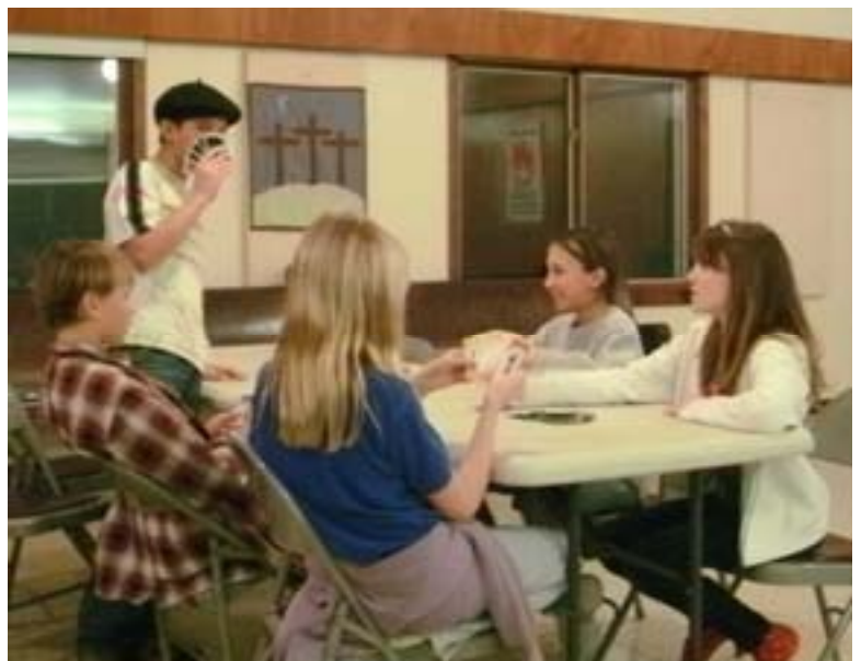
Plow Creek kids enjoying Friday night after the common meal.