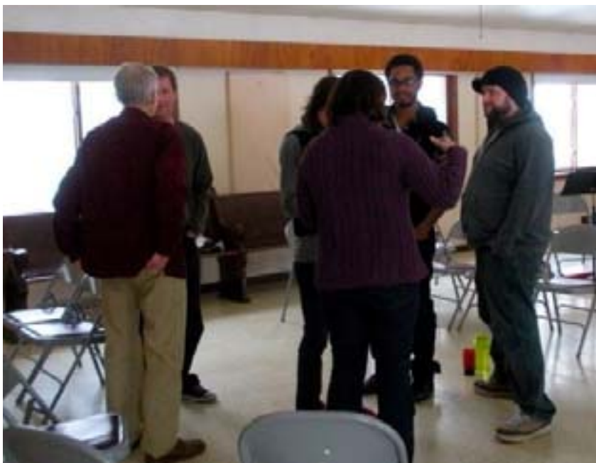
Third Way visiting Plow Creek.

Walking into danger, walking towards death, reminds me of walking into hard pastoral conversations. I feel like I am walking into danger. It is very costly. I find myself drained. What I want to do is go a different way, a way that is not so costly, a way that does not lead me to being hurt. Perhaps I am feeling what Jesus felt. Am I walking towards Jeru- →→→