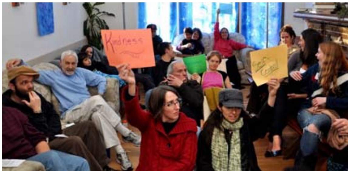
People of the Epiphany at Sojourners.