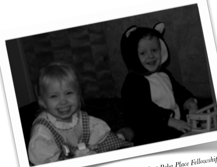
snapshots from life at Reba Place Fellowship