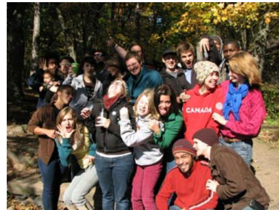
Group shot at Thirdway

In other news the ceiling at Groundswell, our community coffee shop, collapsed in September. It damaged a lot of our equipment and the coffee shop has been closed down as it