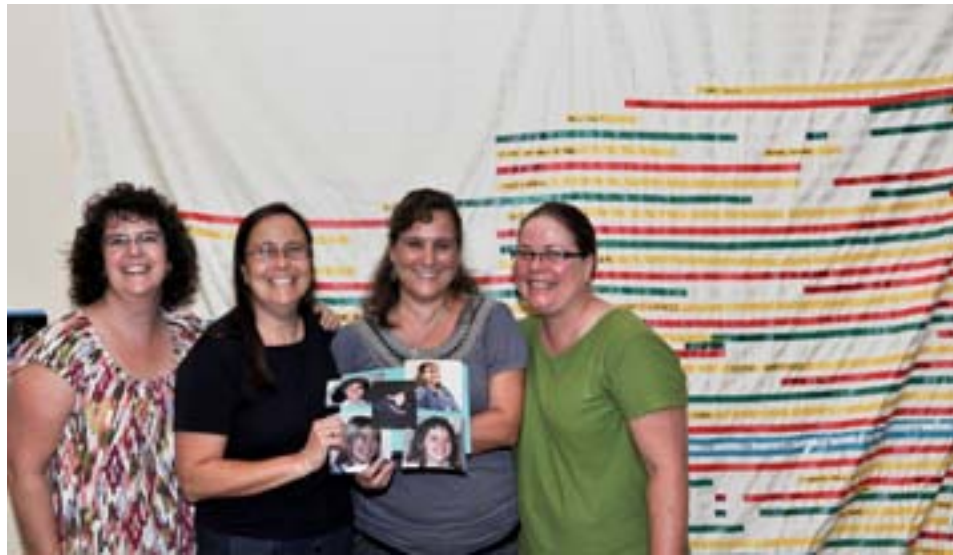
Four original members of Sojourners

As many of you know, a practice we have had for many, many years now is to ask during our worship service "how have you seen God at work this week?" And that question is asked very specifically – "how have you seen God at work in each other this week?" How have you encountered Christ in your brother or sister this week? Some