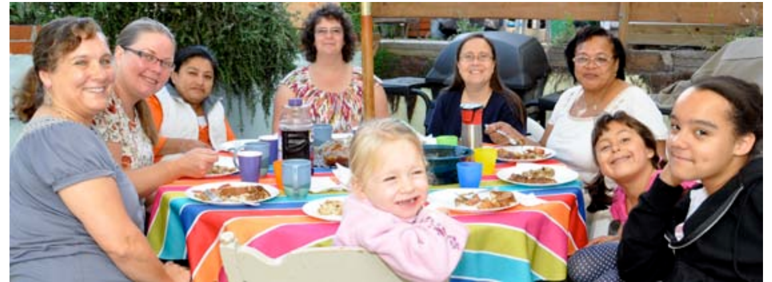
Brunch group at Sojo 25th Celebration

Some individuals in the church have collaborated with others in the Waco community to establish the Waco Time Exchange. A time exchange is an informal institution that allows people to bank and trade their skills equitably. Although this exchange of time and skill sets already happens organically