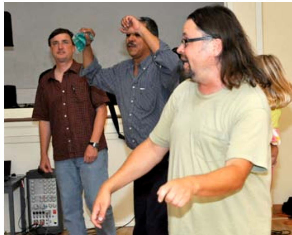
Dancing at the Sojo 25th Celebration