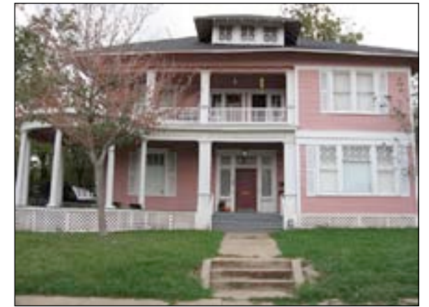
Right: Casa Rosada/The Pink House, a house of hospitality, and an experiment in common ownership for a few members of Hope

During the season of advent, we are gathering jointly for worship and teaching on Sunday mornings, taking leaving of an old structure and anticipating new life and new blessings in an unfolding structure that awaits us. ☞