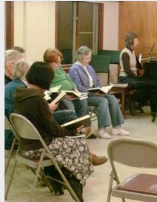
Singing together. You should have heard us.