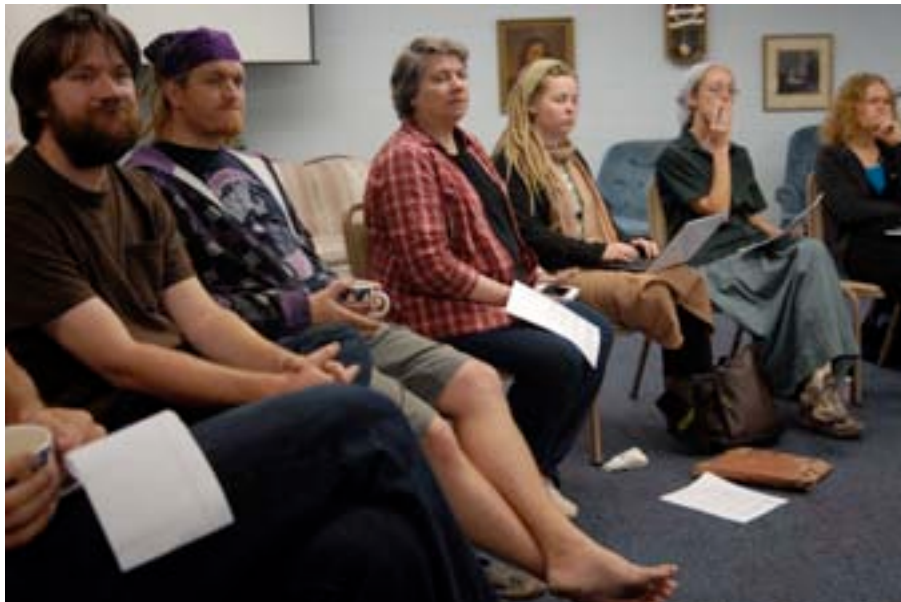
The Nurturing Communities Project gathered leaders from 14 intentional communities together Oct. 12 at Englewood Christian Church in Indianapolis