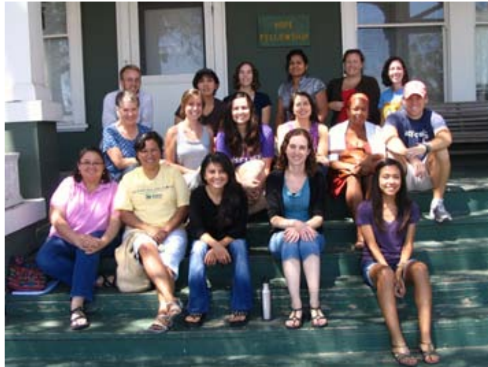
Hope Fellowship hosted a training day for visiting immigrants in detention centers

In the meantime, we continue growing in shared life. Many parents are developing childcare swaps. Others in the church have organized meal shares. Shannon Malburg moved into