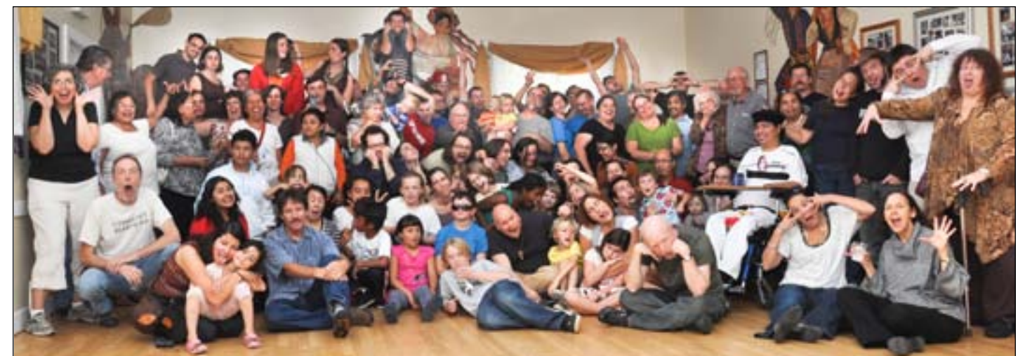
Celebrants at Sojourners' 25th Anniversary Celebration