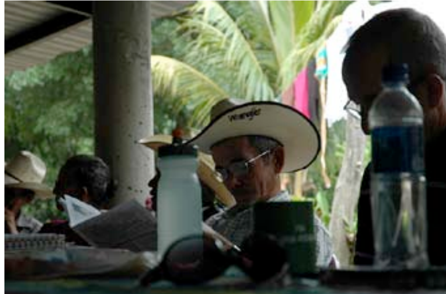
Pastor reads a back issue of Shalom Connections in Valle Nuevo during SMC's visit this year

Shalom Connections is pleased to welcome the community of Valle Nuevo to our official mailing list! Bienvenidos a la comunidad de Valle Nuevo, que ahora recibe este periodico.