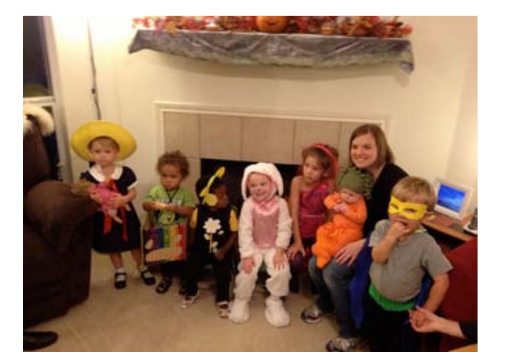
Hope Fellowship kiddos trick-or-treating together