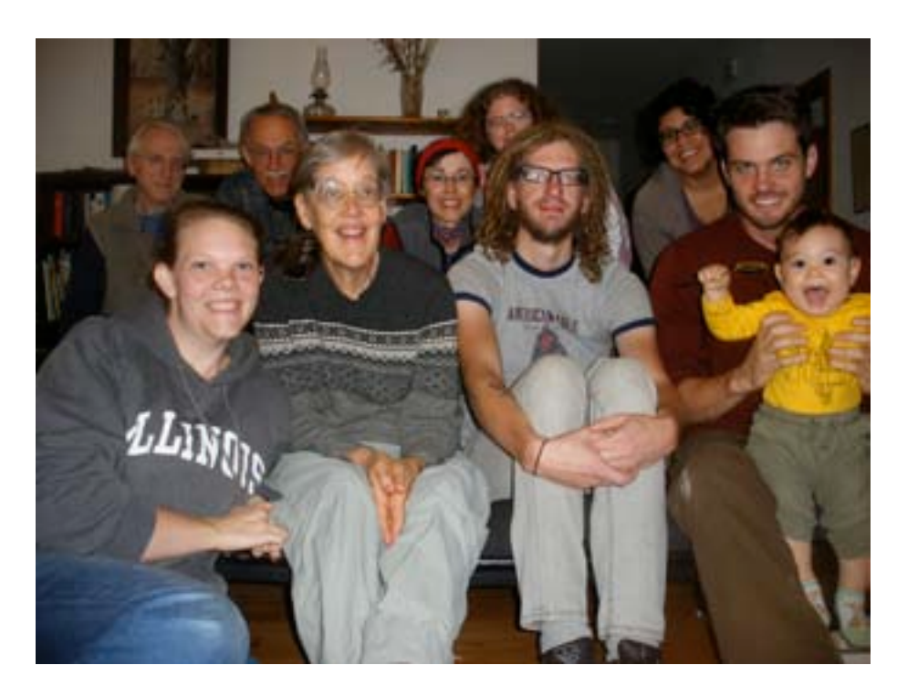
RPF first year novices take time to retreat at Emmanuel Lodge September, 2012