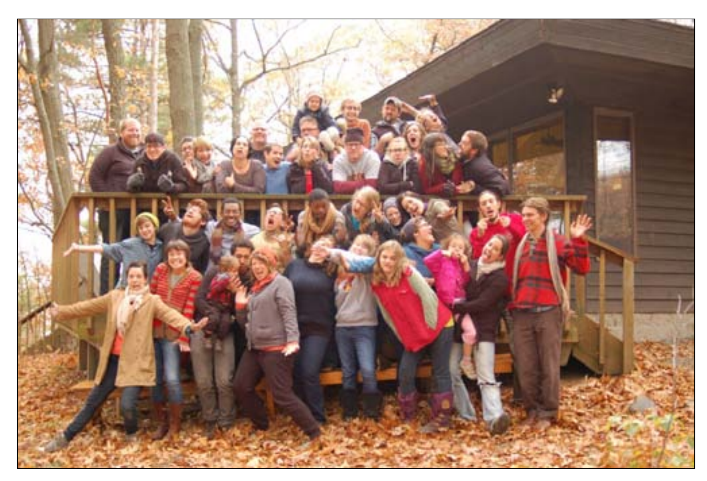
The Thirdway Community at their annual Fall Retreat

The one who testifies to all these things says, "Surely, I am coming soon." Amen. Come, Lord Jesus! Revelation 22:20