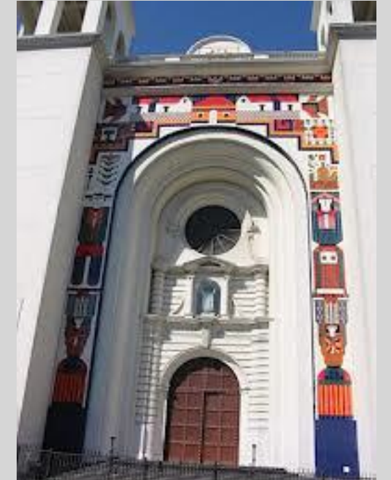
The National Cathedral in San Salvador where this façade by Fernando Llort could be seen until its destruction by the Church in 2011

With the coming of Peace Accords to El Salvador, Fernando Llort opened a gallery and workshop in the capitol city, San Salvador, called Arbol de Dios (Tree of God), and was asked to decorate the façade of the National Cathedral with a monumental collage in the