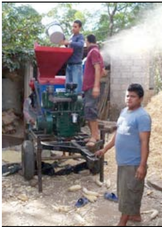
Shelling corn with the new Cooperative machinery.

We will be watching the revival of the Cooperative with interest. They are already talking about what projects they will undertake next, and our hope is that part of their vision will include employment of the three Valle Nuevo university students who have now completed agriculture degrees. WHRI hopes to serve as a resource as they develop strategic plans and undertake future projects. ☺